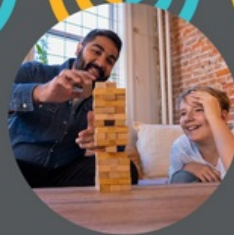
We need mentors in Surrey!