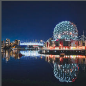
Big Brothers Big Sisters Month