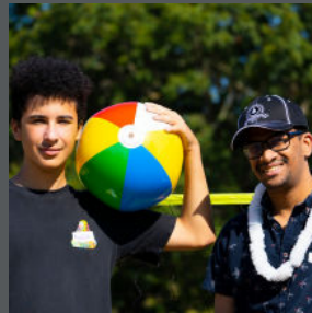
Bigs and Littles Picnic Returns