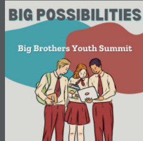
Big Possibilities Youth Summit Wrap-Up