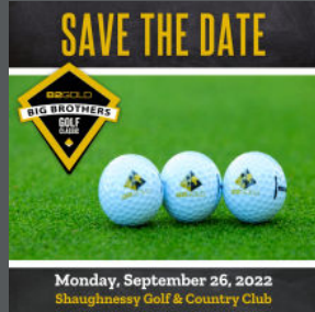
B2Gold Big Brothers Golf Classic